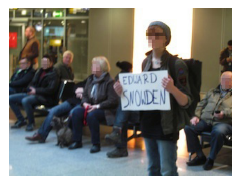
Figure 9 : somebody is waiting for Snowden at an airport.

Some other post-Snowden initiatives did not concern nakedness, but attempted to fool dis-appearance processes. Of special interest are the 'Waiting for Snowden' actions inviting people to go to airports with a paper simply stating 'Edward Snowden', as if the whistle-blower were to appear, suddenly coming out of exile, and publicly emerging at the arrivals terminal (see Figure 9). Of course, Snowden would not appear, and the actions underlined his (forced, problematic) absence.